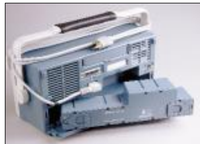
TDS 3BAT – Battery Pack being installed.

Converts ITU-R BT.601 format serial digital video to analog video. Automatically detects and displays 525/60 and 625/50 formats. Provides composite and component (RGB, YPbPr, or YC) outputs. Provides auto equalization for cable lengths up to 250 m and EDH and counting for incoming SDI signal. Adds video picture mode with on-screen line select and vectorscope mode with 100% and 75% color bars. Adds triggering and vectorscope graticules for analog HDTV. Includes full functionality of TDS 3VID Extended Video Applications module. Includes special output cable and four 75 \Omega terminators. Ships with Quick Reference and User Manuals in 10 languages. (Russian not available.)