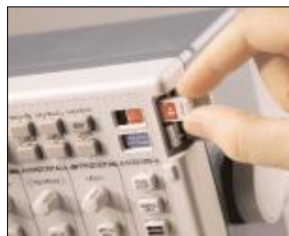
Application Module being installed.